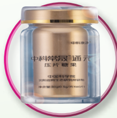
Booth: 4502 TIKANG INTERNATIONAL BIOTECHNOLOGY (GUANGDONG)CO., LTD