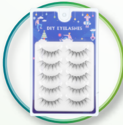
Booth: 4509 SHANDONG HENGMEI ACCESSORIES CO., LTD