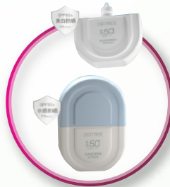
Booth: 4811 REINA COSMETICS (GUANGZHOU) CO., LTD