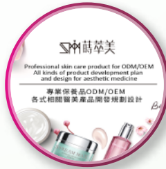
STREAM MAX INTERNATIONAL CO.,LTD

All skin care product for ODM/OEM All kinds of product development plan and design for aesthetic medicine