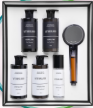
Booth: 2401 UBS INC CO.,LTD