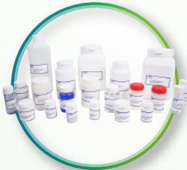
Booth: 2505 WELLPEP CO.,LTD.

Description: Essential Foot Care Fast-improvement/ Fast-absorbing / Non-sticky It has an amazing effect to relieve dry and cracked feet. CPNP/FDA/NMPA