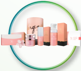
TAIWAN ALPSFACE CO., LTD

All skin care product for ODM/OEM All kinds of product development plan and design for aesthetic medicine