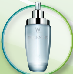
WINEX DERMA INTERNATIONAL CO., LTD.

The balance of mind and body is also a key to activate the power of inner and outer beauty.