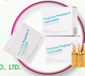
UNO HIGH MAN ENTERPRISE CO., LTD.

Different from the average over-the-counter products, VERGINALE gathers the wisdom from top doctors and experts in 9 fields, including phytology,