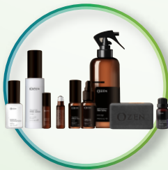
VALID SCIENCES CO., LTD.

Thymus peptide-T® Regulates the function of the immune system Thymus peptide-E® The function of cell repair and regeneration Thymus peptide-S® Promotes the function of improving the metabolic cycle