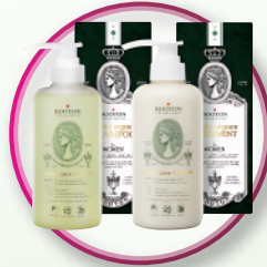
Booth: 2501 YEGREENA

Description: 43 kinds of Highly Functional Cosmetic Peptide and 10 kinds of WellPep's New Peptides