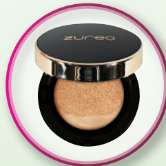
Booth: 2403 ZUREO COSMETICS CO.,LTD

Description: Containing green tea extract, Job's tears seed extract, and Provençal rose flower water. Fortifies hair with ingredients such as menthol, salicylic acid, and panthenol.