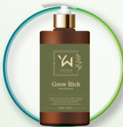
Booth: 2402 YEWON

Description: Anti Hair-loss shampoo & treatment for women