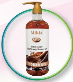
SHENG-SHANG-HUNG TRADING CO., LTD.