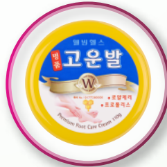
Booth: 2404 WELL-BEING HEALTH PHARM CO.,LTD.

Description: Essential Foot Care Fast-improvement/ Fast-absorbing / Non-sticky It has an amazing effect to relieve dry and cracked feet. CPNP/FDA/NMPA