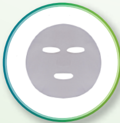
Booth: 4506 ZHEJIANG ZHECHENG NEW MATERIAL CO.,LTD