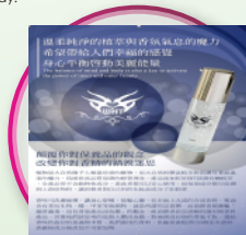
WEI LIN COSMETICS & SKIN CARE PRODUCTS CO., LTD.

OZEN is a brand of experience life. We will show you how to relax in life through the use of essential oils, aroma, and Cosmetics. Be kind, loving and healthy to your body. We believe what we use will eventually become part of our body. We always return to our roots, HOME. OZEN is the connect that returns us home.